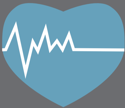
Avoid shoveling snow if you have a medical condition