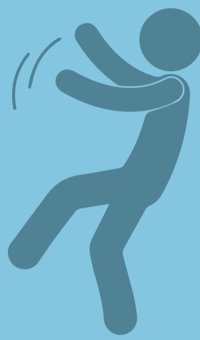
Loss of Coordination