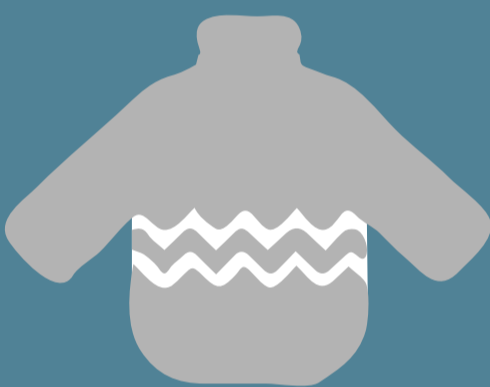
Wear several layers of loose-fitting, light clothing