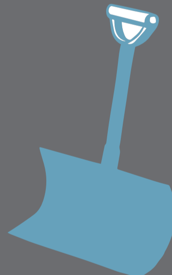
Pace yourself while shoveling and take breaks