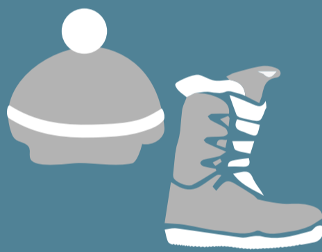
Wear a hat and non-skid shoes