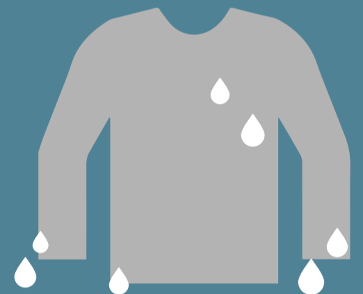
Change out of wet clothes ASAP